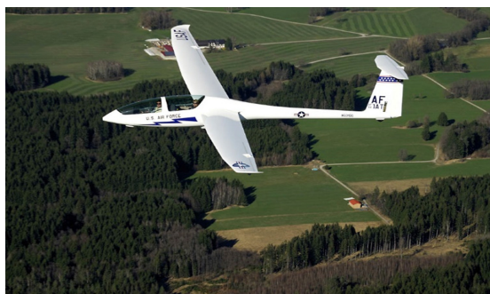
New DG 1001

We propose to hold a meeting for all interested members to discuss the issue at 10:00 am on Sunday 5 Feb (day after Club Class nationals end).