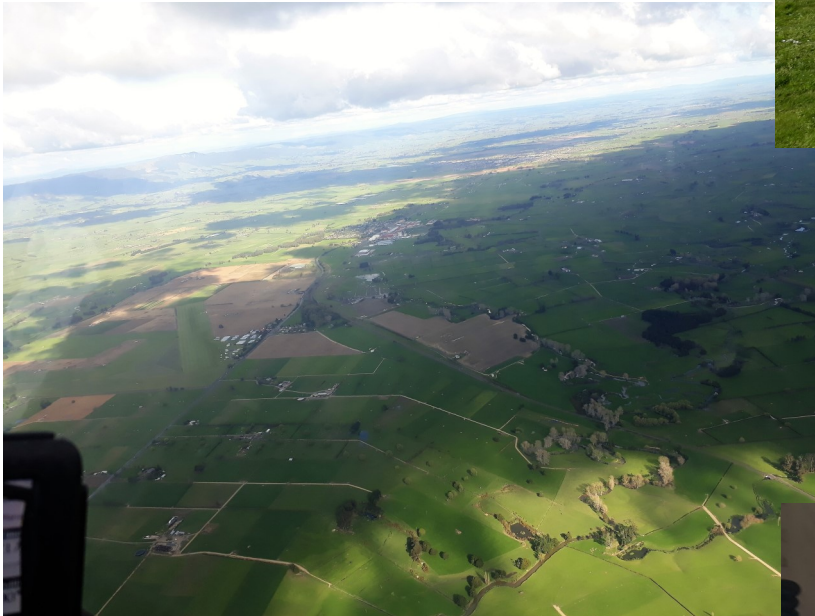
Looking from Up High