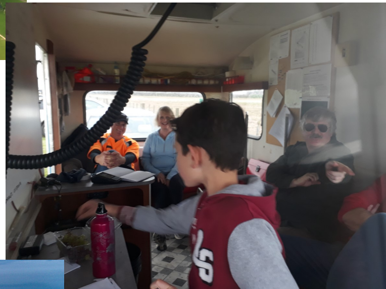
The caravan team with our newest duty pilot