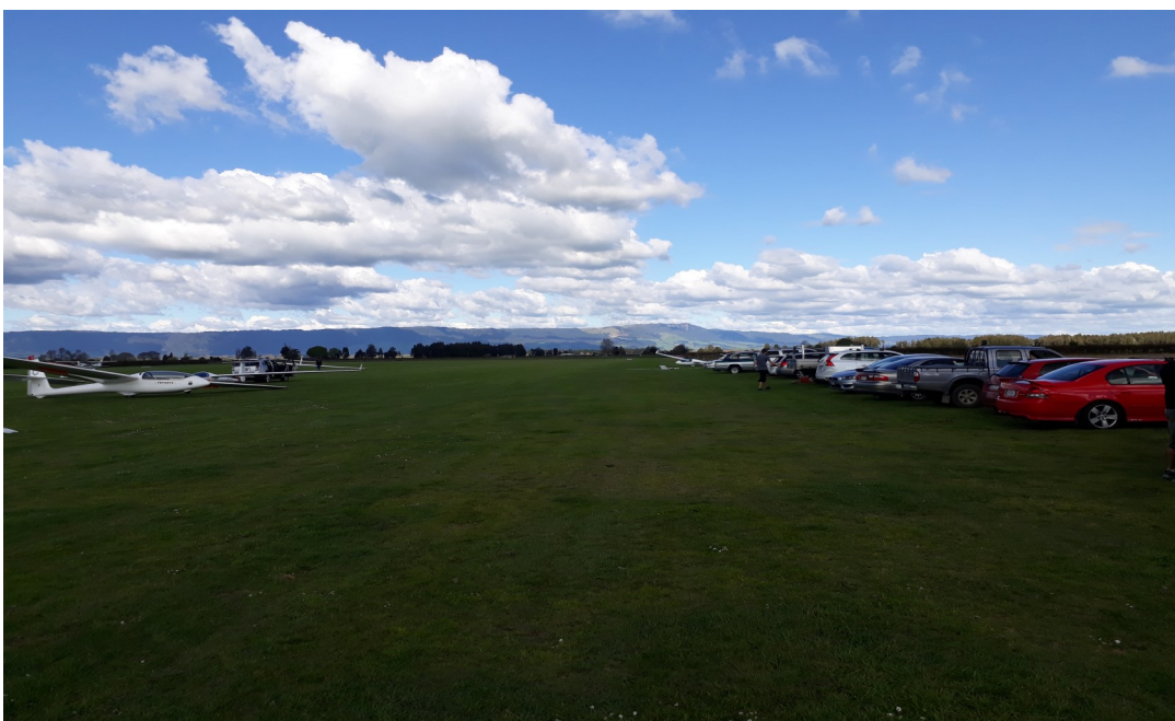
Lots of activity Saturday 23rd Sept