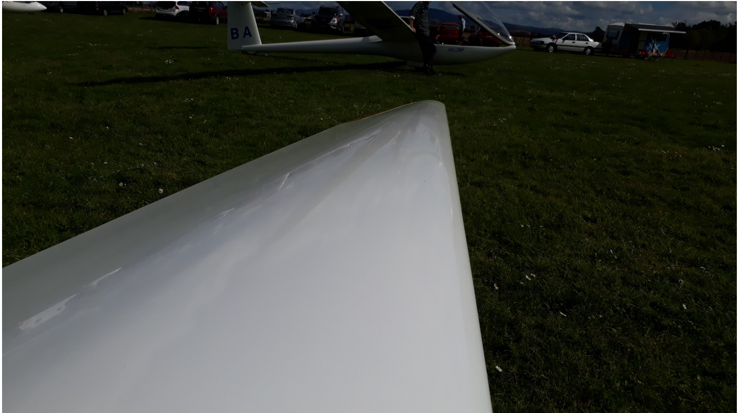
NI's shiny new wings