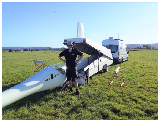
Tim and Derek in very nice looking land-out paddocks