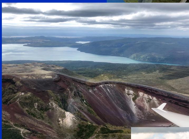
Tim Bromhead in BA flying around Mt Tarawera during the Club Class Nation- als at Taupo