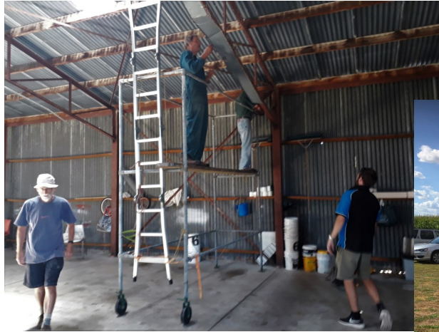
Hangar working bee 2nd Feb.