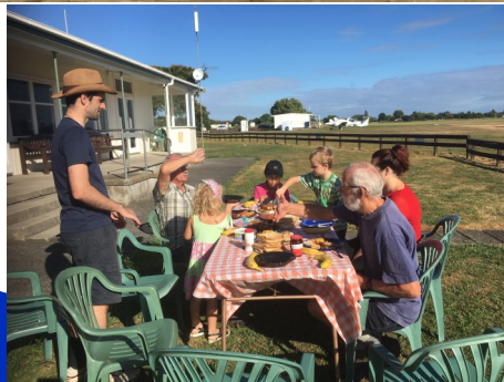
Breakfast at 8-30am, kindly supplied by the Scouts.